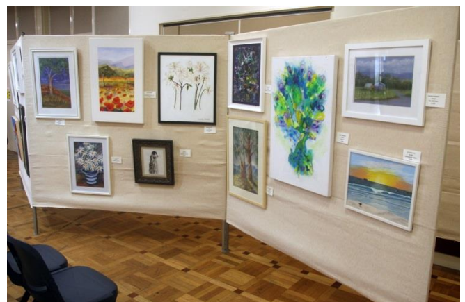
Setting up for The Spring Exhibition Oct 2015