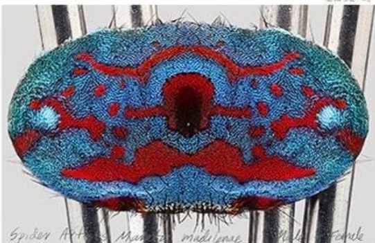
2023 Winner Ravenswood

An exhibition of finalists' works will be held at Ravenswood School for Girls, Gordon NSW 2072, from Friday, 11 to Sunday, 26 May 2024; email artprize@ravenswood.nsw.edu.au , or visit ravenswoodartprize.com.au