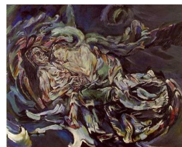
"Bride of the wind" Oskar Kokoschka

Then onto Tokyo, spent time at a wonderful exhibition at the Tokyo Metropolitan Museum of art by Schiele, Klimt, and Kokoschka ... it was a sizeable exhibition displayed over several floors.