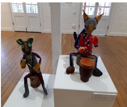
Kitchen Medley 1 and 2

Roxy Gallery in Kyogle is spacious and filled with light. A variety of artistic styles were exhibited on the theme of “Intimacy.” I was unable to photograph the lovely watercolours as my reflection on the glass was prominent. But I've added the fun creatures called “Kitchen Medley 1 and 2” and the wonderful painting of curlews called “Nesting”. Unfortunately, the exhibition closed on the 27 August.”