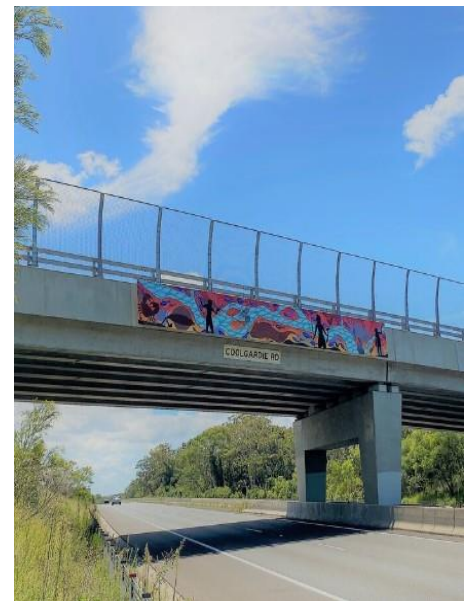
Installation of Coolgardie

nrcg Northern Rivers Community Gallery & Ignite Studios