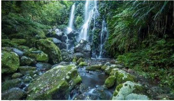
Chalahn Falls