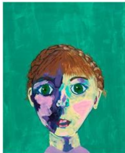
Phoebe Raft – My Crown