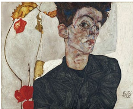
Self-Portrait with Physalis, 1912

I'm not afraid to admit he's one of my favourite artists. In 1912, Schiele and his (then partner) Wally Neuzil moved to Neulengbach, attempting to find new inspiration away from Vienna. While the respectable citizens of the town avoided Schiele, local children from poor families were fascinated by the artist. Schiele sometimes paid teenage girls to pose for him, to the great outrage of their families who believed that modelling was a synonym for sex work.